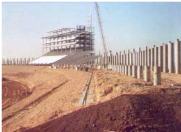
The final turn toward the Grandstands

A short drive from Lawrence, and just outside of Kansas City, the students arrived at the Kansas Speedway to observe the construction and discuss the ISCB case. The state-of-the-art 1.5-mile track is financed by ISCB, owned largely by the France family, and is scheduled to open in 2001.