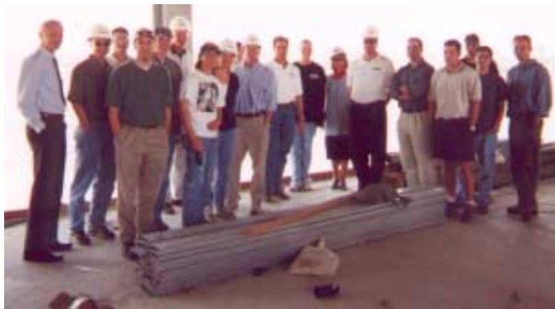
The APM class touring the luxury suites

After the case review, the students were given a tour of the facilities. The massive spectacle was viewed from atop one of the soon-to-be luxury suites whose licensing agreements are being sold to local businesses for $30,000. Tickets can now be purchased for events with the first NASCAR event set for the fall of 2001. Information regarding the Kansas Speedway and ticket purchasing can be obtained by visiting their web-site at www.kansassuperspeedway.com .